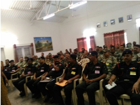
Army Jawans during the Awareness Program.