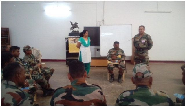
Army Jawans during the power of Networking session.