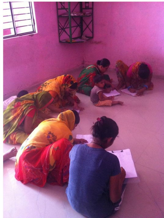
Participants of NEEV workshop during an activity.