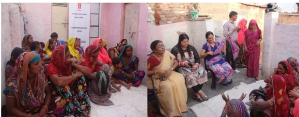
Participants of SOS village interacting with the Facilitators.