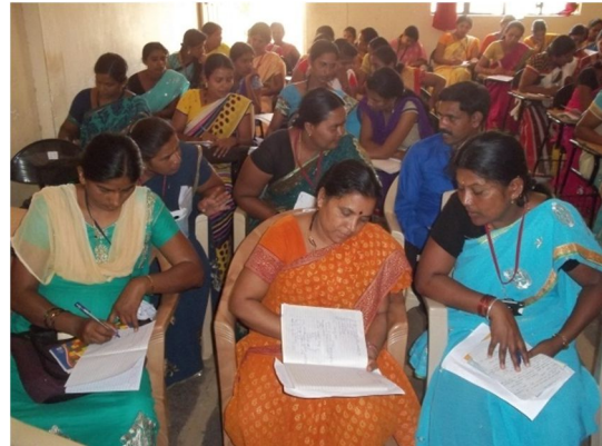
Women Participants of SKDRDP making notes during the awareness program.

NEEV (I Create center at IITGN) conducted two awareness sessions on 6 th and 7 th of April at Palaj Village. .