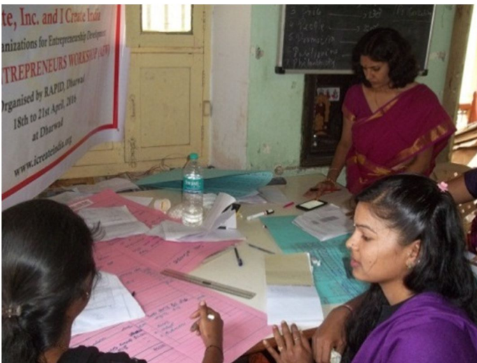
Participants of RAPID workshop gearing up to present their Business Plan.

NEEV (I Create center at IITGN) conducted a workshop from 11 th to 15 th April at Palaj Village. Details awaited