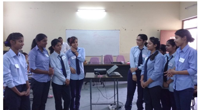
Students of Govt. ITI, Banipark, Jaipur during a debate.