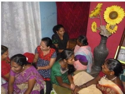
Participants of Margadarshak in discussion.