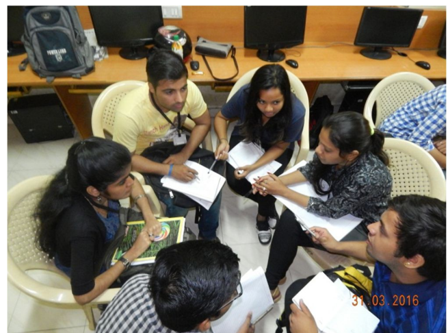
Students discussing during the CMS workshop