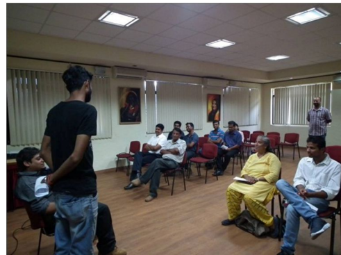
Participants during the awareness program at Goa.

I Create Banyan City conducted an awareness program for 53 participants at TARGON Village of Chhota Udaipur District near Vadodara. The session was conducted by Shashi Tuteja.