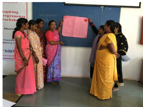
Participants of BDSSS presenting their Business Plan.